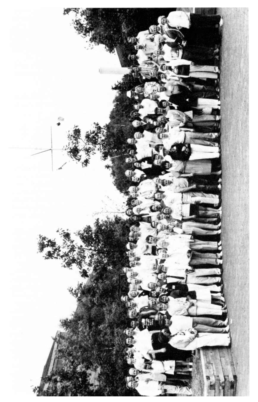
Delegates to the 1989 RASC General Assembly in Sydney, Nova Scotia.