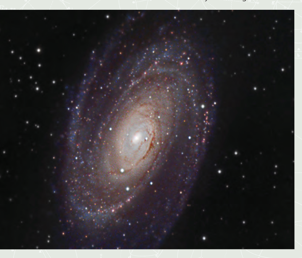
M81, BODES GALAXY This 10-hour image was taken with an 11-inch EdgeHD Schmidt-Cassegrain telescope and a QSI 583wsg CCD camera.