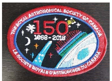
Celebrate with the RASC!

Get your 150<sup>th</sup> gear and support the RASC today!