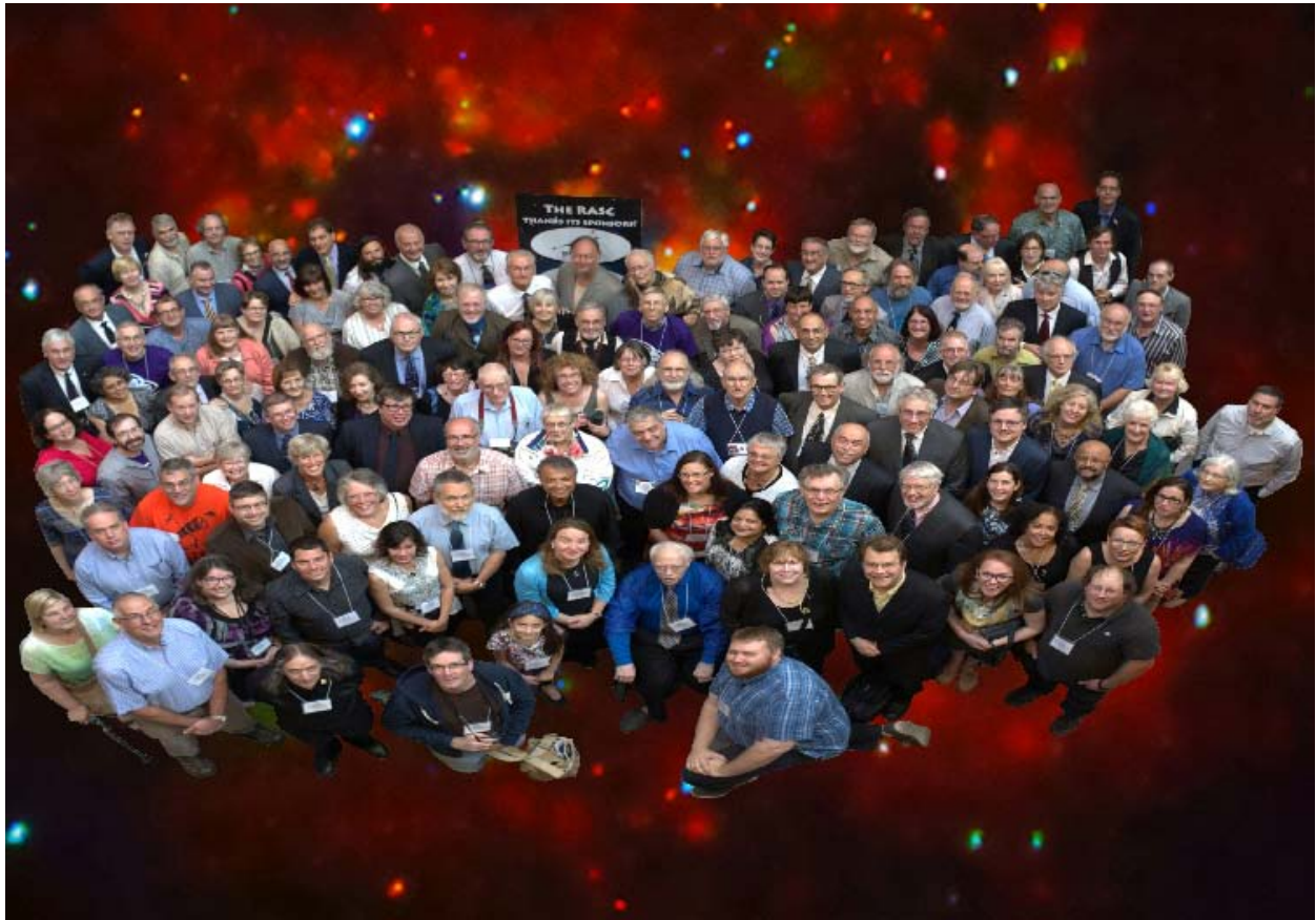
GA 2016: Group image, London, Ontario.