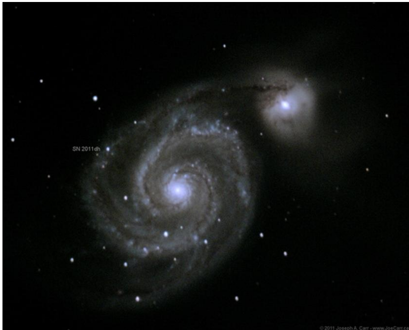
This photo of Supernova SN2011dh was taken by Joe Carr (Victoria Centre) on June 4 at 0100 PDT.

Equipment: 14" Meade LX-200 SCT operating at f/10; QSI 583c colour CCD camera; Paramount ME