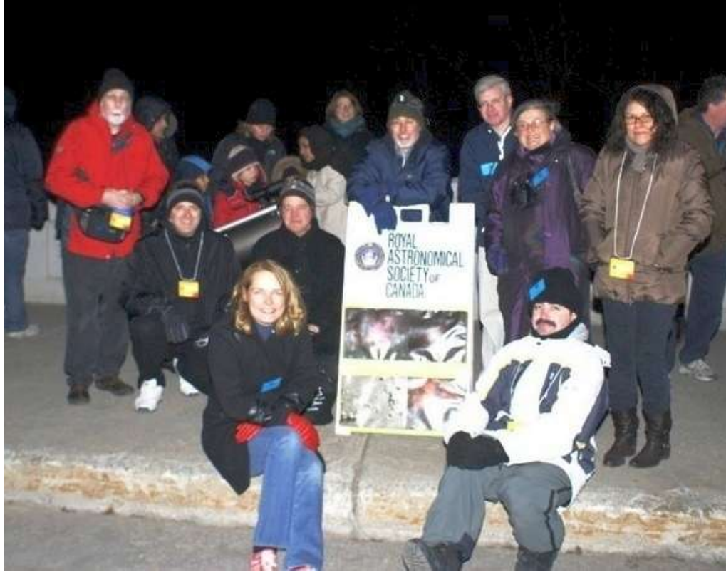
Group photo of some of the RASC volunteers.

event. There were 10 Montreal Centre volunteers who participated and, as usual, we put on a great show. We had dedicated telescopes showing the Moon, Saturn, Mars and the Orion Nebula so visitors got to see a variety of objects.