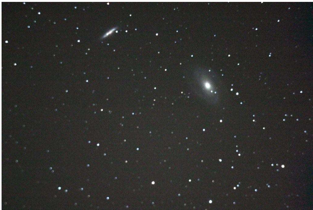
M81 and M82, taken from West Sechelt, BC