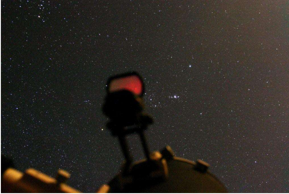
Orion, taken from West Sechelt, BC