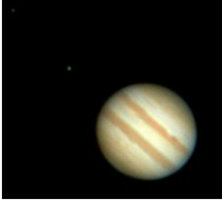
JUPITER: Stack of 70 exposures, 1 - 10 seconds, taken with a Nikon 5000, 8 SCT, 25mm eyepiece

topics. Click on www.rascmontreal.org/Gallery-Astro-Misc.html [8]. Here's a two-photo sample. (Please note that all images are the property of the respective Montreal Centre members.)