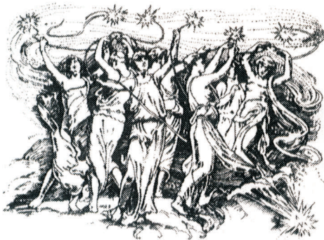
The Seven Sisters

Taurus: Jupiter became enamoured of the beautiful Europa. He assumed the form of a snow-white Bull and the impetuous Europa, charmed by the lovely creature, climbed on his back. Taking advantage of the situation, Jupiter bore her across the seas to Crete. The event is commemorated on earth with the naming of a continent, and in the heavens by the constellation Taurus. ★