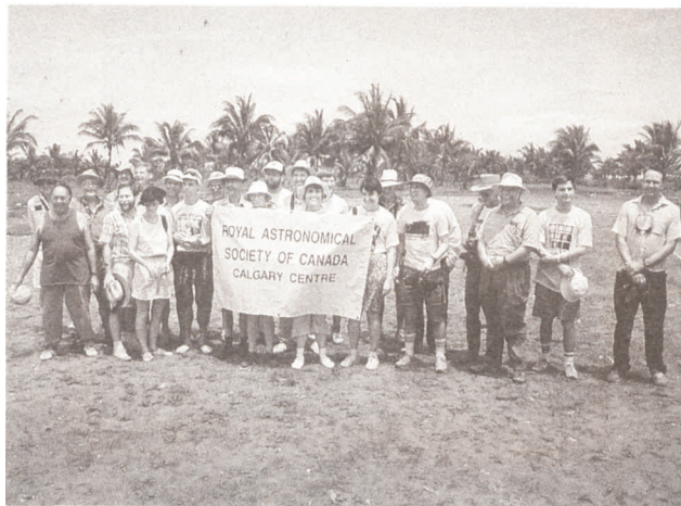
Calgary Centre members in Mexico.

Noon eclipse day minus one, was sunny with cloudy patches, but very hopeful. Noon also brought a phenomenon I had not experienced