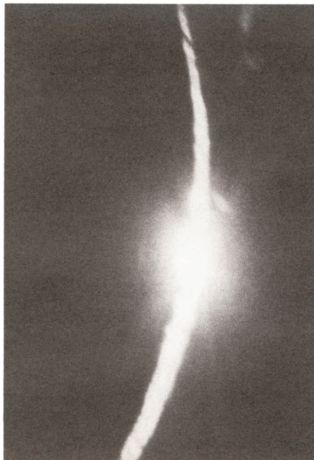
The diamond ring at second contact from Mauna Lani, Hawaii. The exposure was for 1/500th second on Fuji Super HG 400 film.

It is getting quite dark and the Sun is a very thin crescent, but no shadow. Snap. Look, the