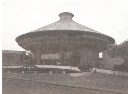
The H. R. MacMillan Planetarium was the setting for the barbeque and the slide and song contests. The dome is shaped like a native hat and is "guarded" by a sculpture of Cancer the crab.

That evening, a tour was held at the facilities of the MacDonald Dettwiler Company, which is world famous for its work in satellite imaging and in data processing systems for surveillance and