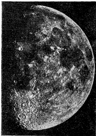
Our Nearest Neighbor

Nearest of all the heavenly bodies to Earth is our satellite, the Moon—only 239,000 miles away. Earth has only one moon, Mars has two, while giant Jupiter has 11 and ringed Saturn nine. Our Moon appears to be a dead world, without trace of air or water. It is seen by us only when sunlight, falling on its rocky surface, is reflected toward our eyes. Thus its phases change as it shifts position relative to Earth and Sun while it revolves around Earth once in about four weeks (a month or