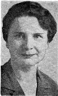
DR. HELEN S. HOGG

Research Associate, David Dunlap Observatory and Associate Professor of Astronomy, University of Toronto.