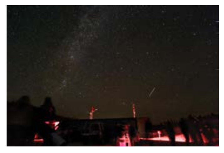
An evening of Public Outreach at the Okanagan Observatory

lastly, this year our Outreach provided astronomy presentations for Science Literacy Week collaborating with the Okanagan Regional Library and the Centre for Inquiry. During September we visited 10 libraries up and down the Okanagan valley and in the process spread the astronomy word to approximately 500 children.