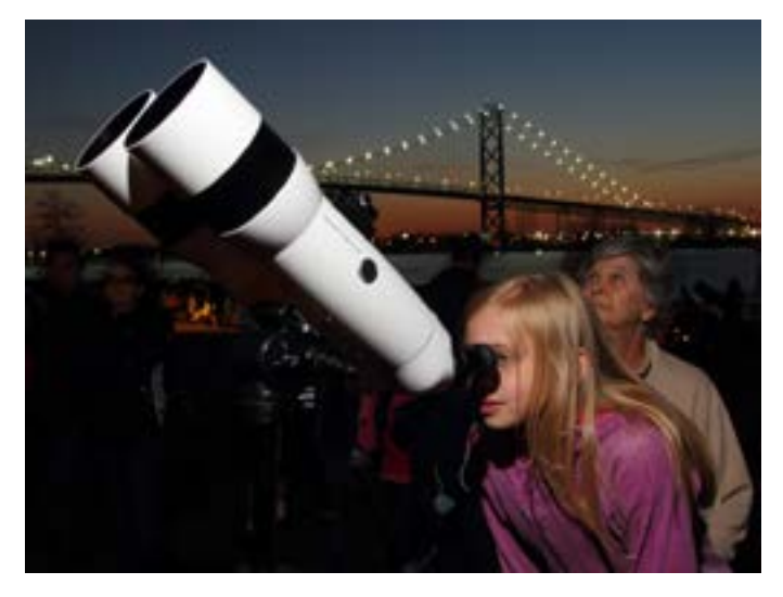
Youngster having her first close-up view of the moon through at a public stargazing event we held downtown in the Sculpture Garden on the banks of the Detroit River near the Ambassador Bridge.

centre warm room PC. Public Open House evenings are held once each month, with members able to receive their own key to access the site following training on use of dome and equipment and paying an annual fee.