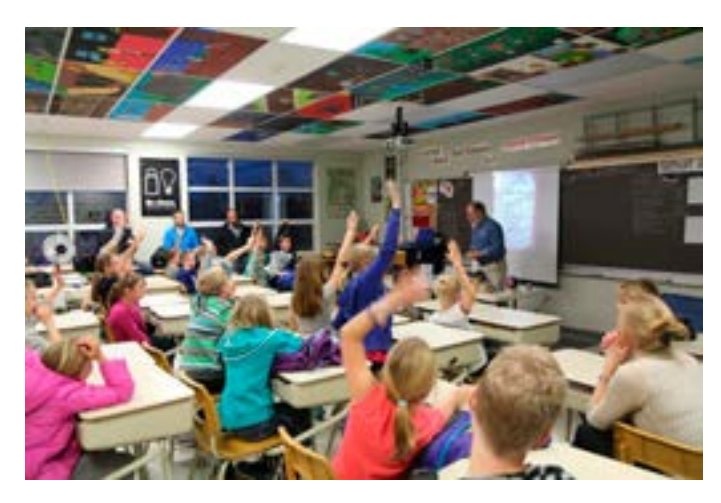
Niagara Centre Grade 6 outreach event

At our observatory, we sold the club's 12" Meade SCT and fork mount and replaced it with a Losmandy G11, to make the observatory more accessible and easier to use for our members who want to try astrophotography.