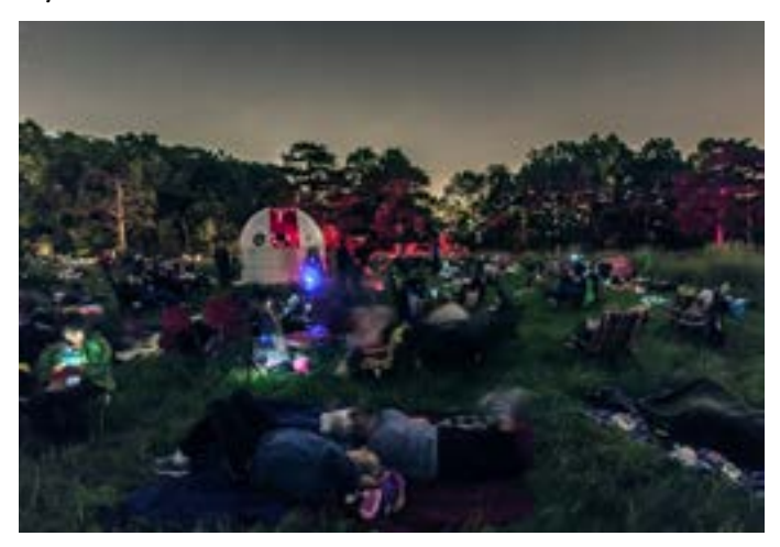
Perseids event

During 2015, the Montreal Centre had allocated 14 evenings, spread over the calendar year for members observing nights. Due to the unpredictability of the weather, we had the chance to enjoy only 3 evenings out of the 14 scheduled. Rain dates did not fare any better.