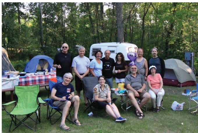
Winnipeg Centre Public Event 2014

The Winnipeg Centre participates in numerous regular astronomy events; some where we provide viewing opportunities for the General Public. One such event is the "Astronomy Night," held in March for the members of Fort Whyte Alive, a regional conservatory agency. It features our members providing presentations during a