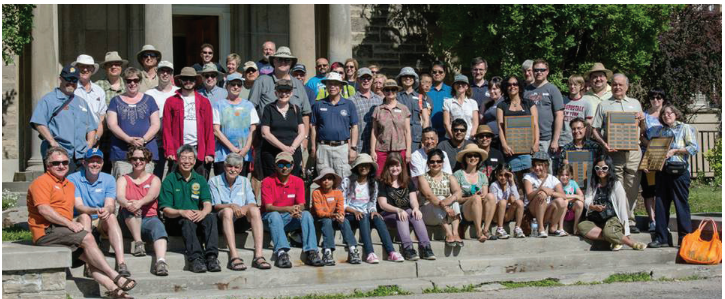
David Dunlap Observatory Awards Picnic

This summer we built five lockers inside the CAO garage for members to rent to store telescope equipment. The My Own Dome Lot project implemented in recent years, which allows members the privacy of their own dome with power and internet at the CAO currently has one of the six available sites available for lease. The five sites occupied by members bring in valuable income - $3960