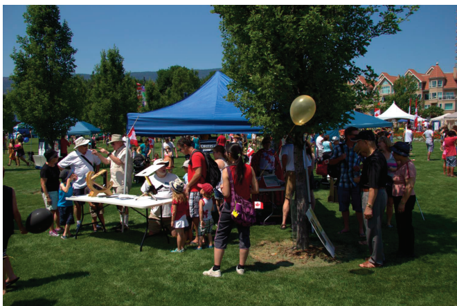
Okanagan Centre members with festival visitors at Kelowna’s 2014 Canada Day