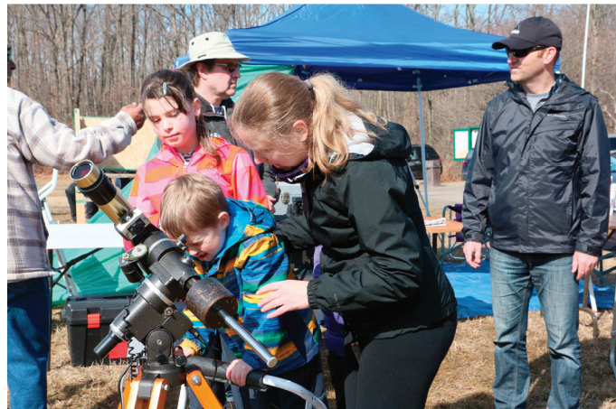
Solar observing for public at Beamer's Point Conservation