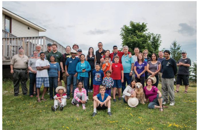
Carr Astronomical Observatory Star-B-Que