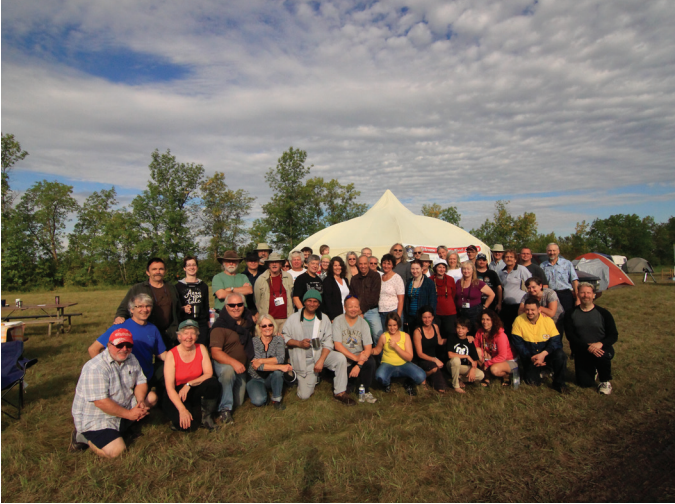
Winnipeg Centre SWSP Group 2014