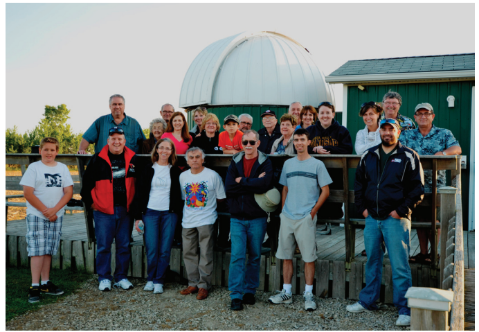
Windsor Centre picnic 2014 Hallam Observatory

The Windsor Centre manages its own observatory far outside the city within the municipality of Lakeshore. Named after one of Windsor Centre’s founding members, Hallam Observatory consists of a 12-foot high dome with a warm-up room connected to it, including an observation deck attached on the outside. Within the dome is our pier-mounted Celestron 14 Schmidt-Cassegrain telescope, with an Astrotech 111 refractor mounted onto it with a CCD camera used for auto-guiding, all of which is operated via a