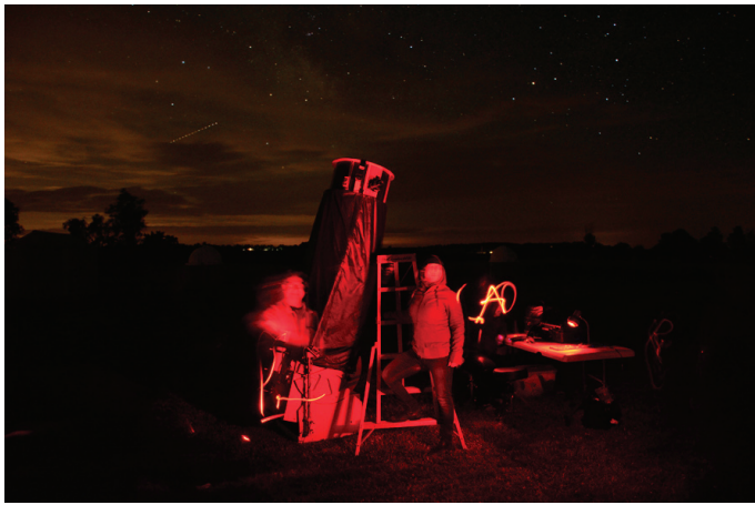
CAO Star-B-Que

annually to the Toronto Centre. $1600 in annual income also comes from the lease of the surplus CAO acreage to a local farmer. Income from the sale of annual CAO passes and user fees exceeded $7400.