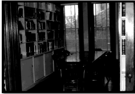
Portion of the former RASC National Library at 252 College Street

Centres should not hesitate to contact us if they have any questions of any sort regarding their archival material.